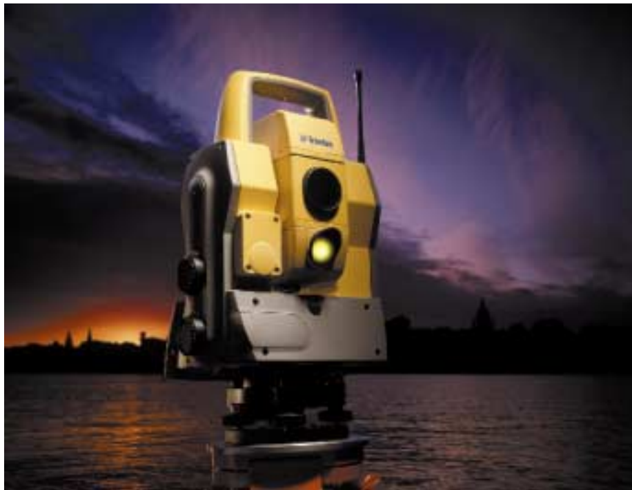
Figure 3: Trimble 5600 DR + (Robotic version shown)

In Fig. 1, two targets, A and B are shown separated by less than the pulse length. The dark pulses shown moving right to left are emitted. The grey pulses shown moving left to right are reflected. It can be seen that the pulse reflected from the closer target A will interfere with the pulse reflected from B. When the targets are separated by more than the pulse length as in Figure 2, it can be seen that such interference does not occur. It should be apparent from inspection that the separation between A and B at which interference is likely to happen is at one-half of the pulse length.