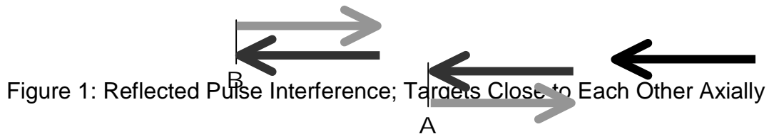
Figure 1: Reflected Pulse Interference; Targets Close to Each Other Axially